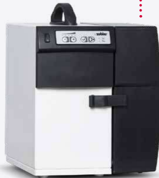
Z1-M Series Single suction units