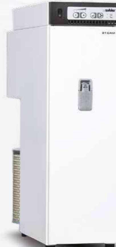
Z1 Series Single suction units