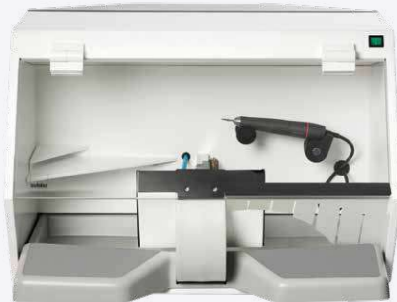
AV1000 Preparation Box