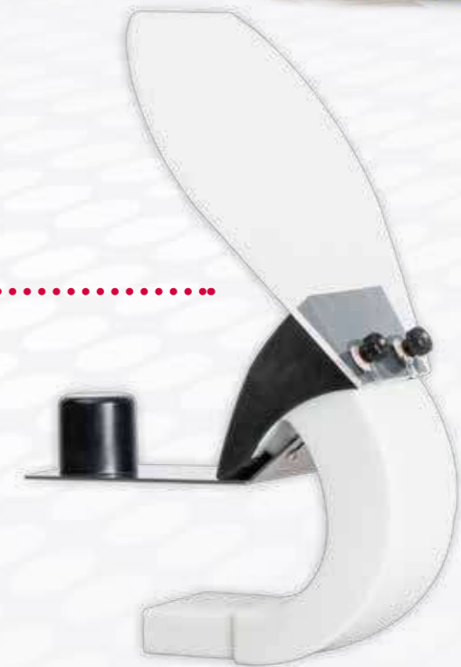
R 2200 Suction Funnel with safety glass