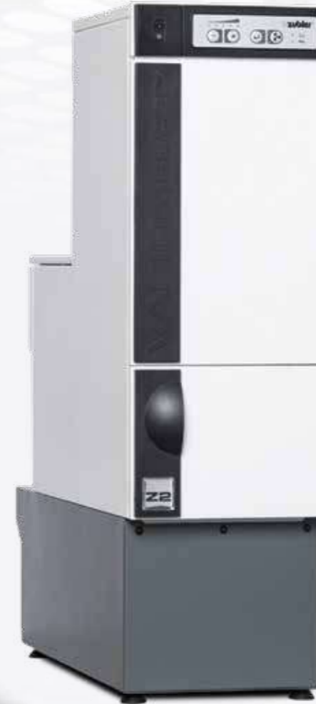
Z2 Multi suction unit