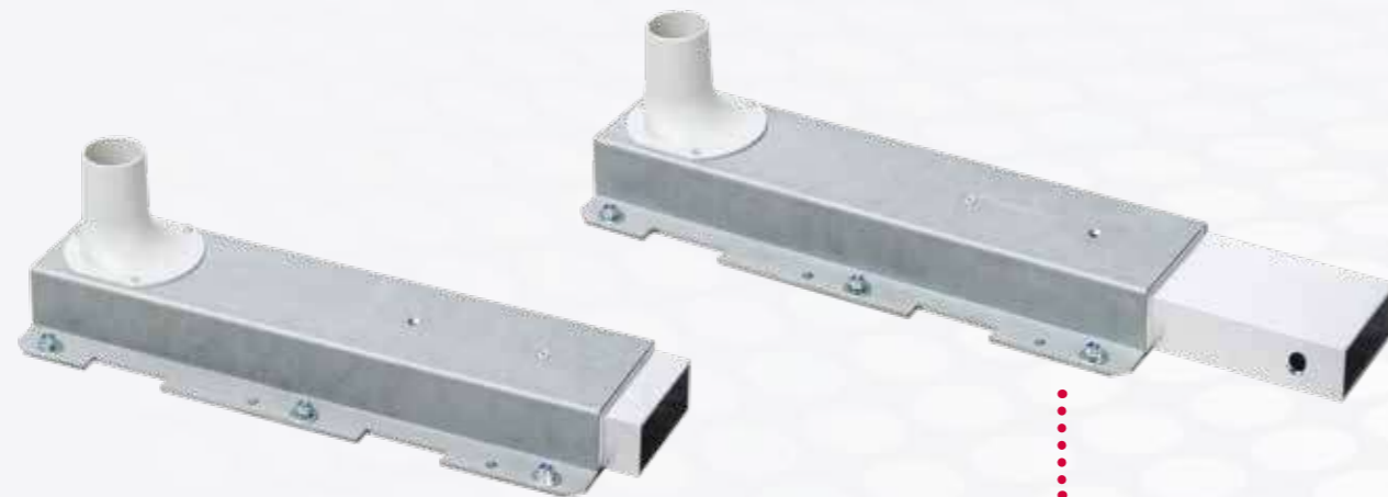
R 2000 Rectangular Pipe