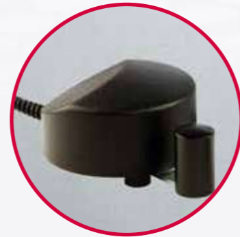
Foot control lever