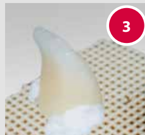
Pressed object after firing