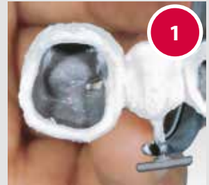
Ceramic shoulder before firing