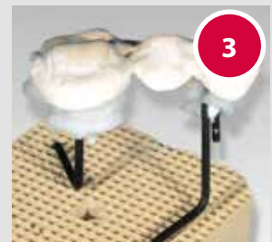
3-unit-bridge prepared for firing