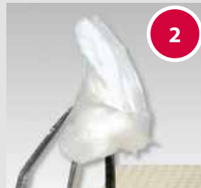
Put on firing tray carefully