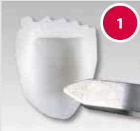
Safe holding with Easy-Grip™