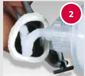
Fill with Easy-Fix™ paste