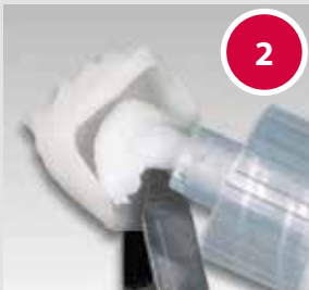
Fill with Easy-Fix™ Paste