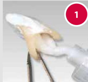
Put in Easy-Fix™ Paste