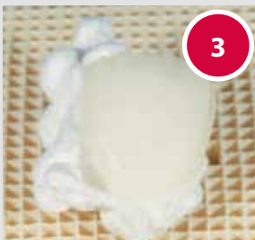
Completely fixed firing object